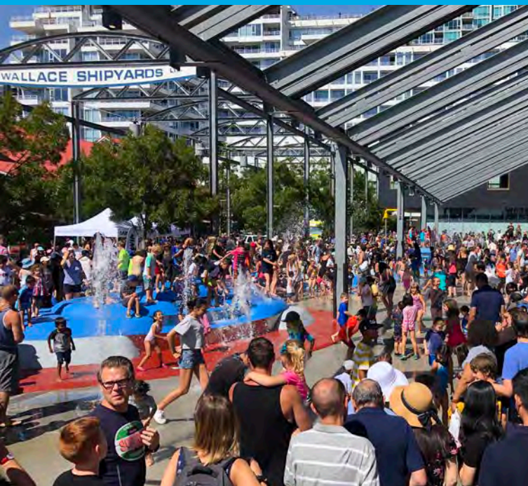
The Shipyards, North Vancouver, BC