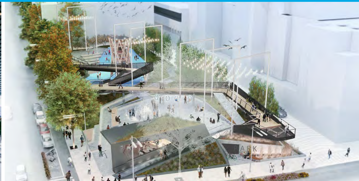
sθaq̄lxenəm ts'exwts'áxwi7 Rainbow Park, Vancouver, BC