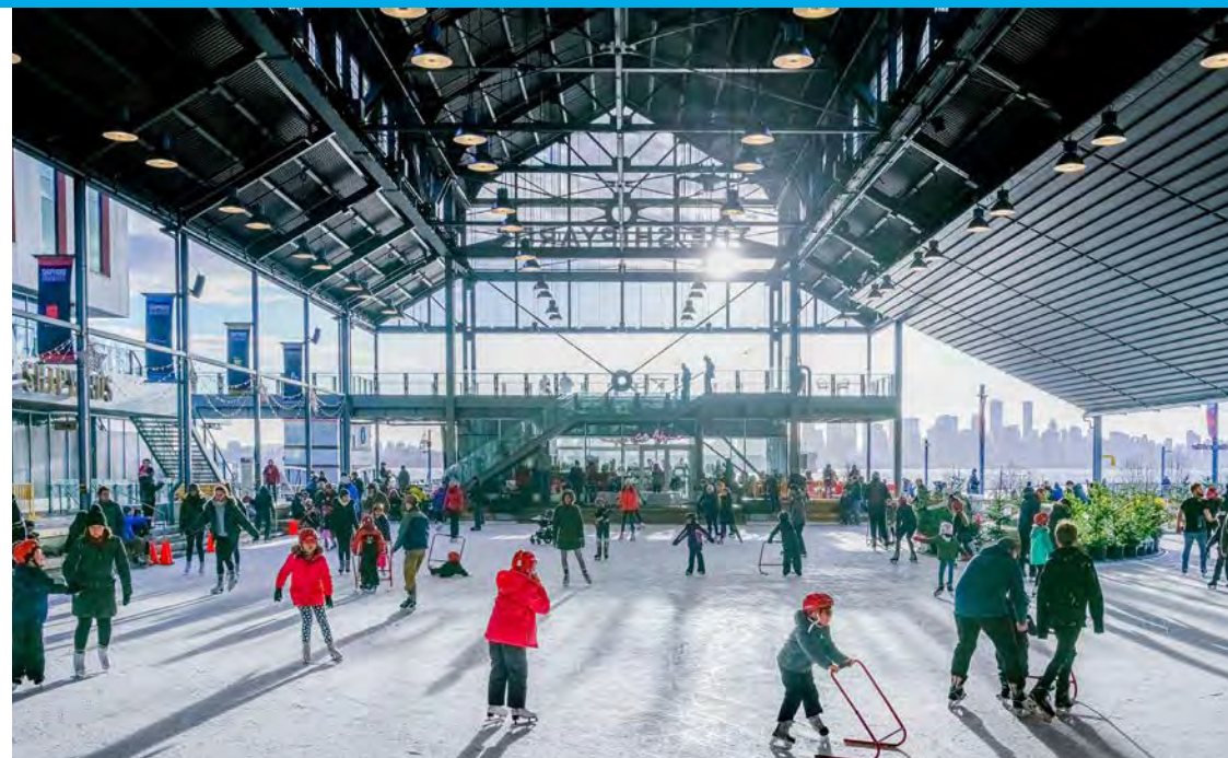
The Shipyards, North Vancouver, BC