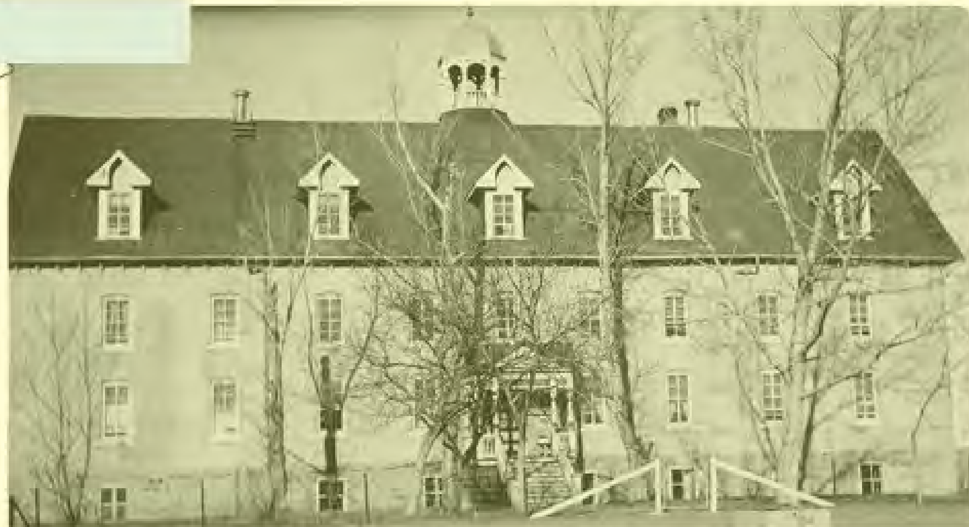
Marieval Cowessess Indian Residential School in Elcapo Creek Valley, Saskatchewan, n.d.