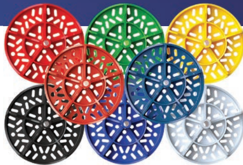
4" disks & 6" disks