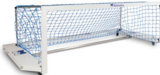
Water Polo nets