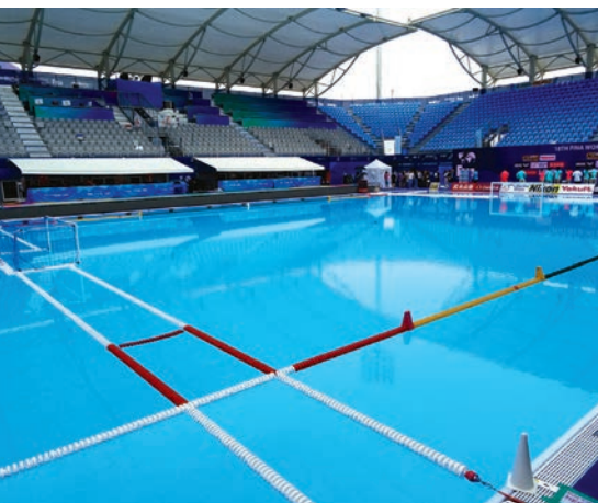
Custom Waterpolo field of play