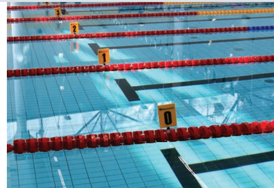
Custom Lane lines